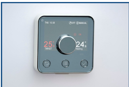
Heating Control Panel

Unrestricted road parking is available on the main road